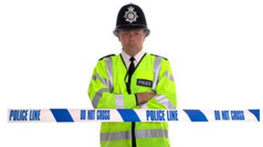
No, not that kind of copper!

Prana's PBT2 trial in Huntington's is a Phase 2 trial — so, it'll be quite small overall, involving a hundred volunteers. In a press release, the company says it's aiming to involve about 15 sites in Australia and the US — that means an average of six to seven volunteers per site. The trial will involve people with 'early' Huntington's disease. Broadly speaking, that means people who have HD symptoms like involuntary movements, that are fairly mild and don't prevent them walking, working or functioning at home.