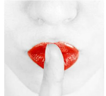
Gene silencing is a promising approach to preventing and treating HD. Each step along the way to human patients has to be carefully checked and tested.